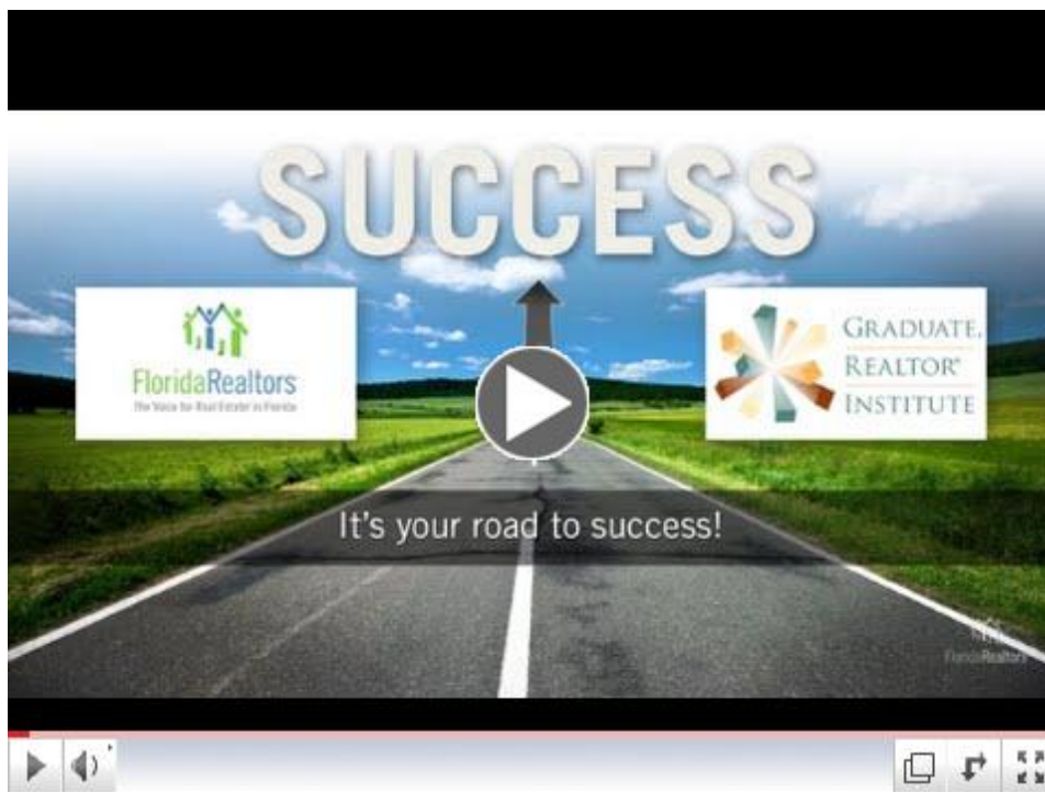
Why Should You Get Your GRI?

GRI 300 Series Registration Form GRI FAQs